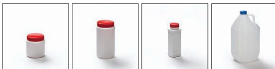
500 g Jar 1 kg Jar 500 g Shaker 5 L Hex