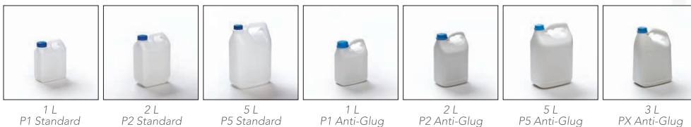
1 L P1 Standard 2 L P2 Standard 5 L P5 Standard 1 L P1 Anti-Glug 2 L P2 Anti-Glug 5 L P5 Anti-Glug 3 L PX Anti-Glug