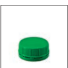
46 mm PET Cap