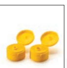
28 mm Fliptop Squeeze