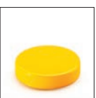
84 mm Jar Lid