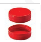
70 mm Lid (Plugged)