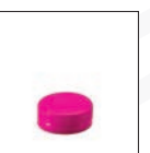
38 mm PET Cap