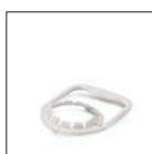
38 mm Handle (2/3 Litre)