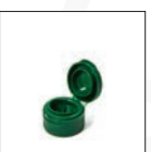
28 mm Fliptop Pourer