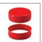
70 mm Lid (Wadded)