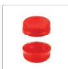
38 mm C5 Dairy Closure