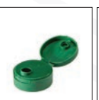
38 mm Fliptop SnapOn