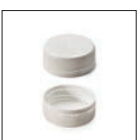
38 mm C3 (Plugless)