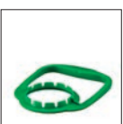
46 mm Handle