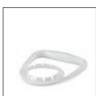
38 mm Handle (4/5 Litre)