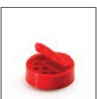
50 mm Sprinkle Cap