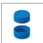
38 mm C3 Dairy Cap