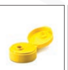
38 mm Fliptop Threaded