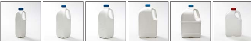
1 L Square DairyCan