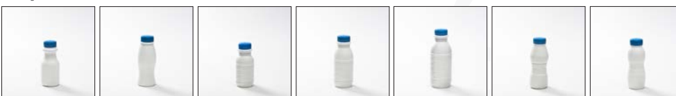
250 ml DairyRound