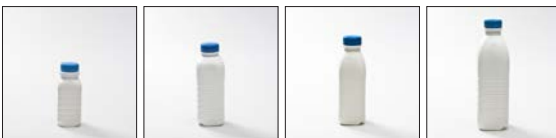
250 ml DairySquare