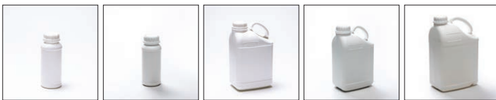
1 L Agri 60 mm Neck 1 L Agri 64 mm Neck 5 L Agri 60 mm Neck 5 L Agri 64 mm Neck 10 L Agri 60 mm Neck