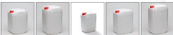
20 L Square Rib 25 L Square Rib 10 L Rectangular 20 L Rectangular Rib 25 L Rectangular Rib