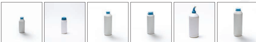
250 ml General Purpose 28 mm Neck 250 ml General Purpose 38 mm Neck 500 ml General Purpose 28 mm Neck 500 ml General Purpose 38 mm Neck 1 L General Purpose 28 mm Neck 1 L General Purpose 38 mm Neck